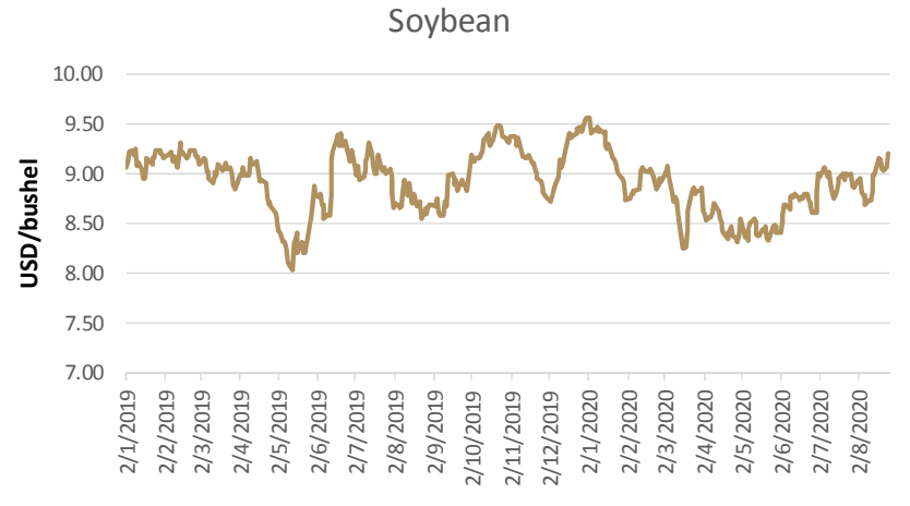
Figure 1: Price trend of Soybean

Jan-Aug 2020 CBOT soybean average price has dropped 1.4% YoY against previous corresponding period, while CBOT corn recorded 11.6% YoY decline. The low prices of soybean and corn should alleviate some pressure on margins for we reckon the group has taken opportunity to lock in procurement to meet its requirement up till end-2020.